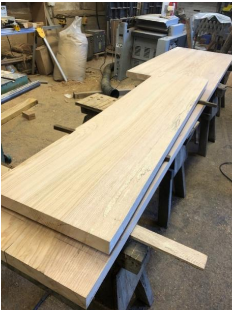
Wood prepared from trees on site for use in reception Corridor lighting installed in Parfitt