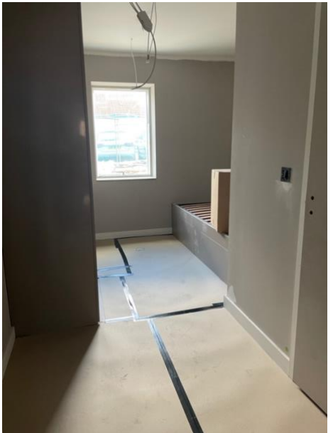
Cluster bedroom with furniture installed - MacDonald