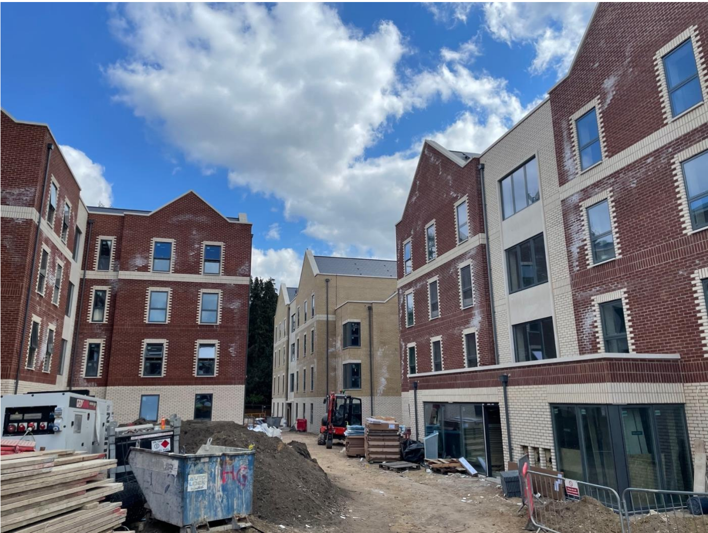
View of site courtyard as at Friday 16 April