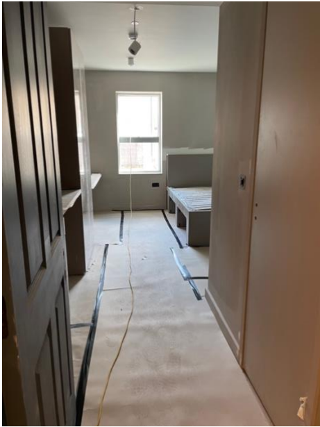
Cluster bed with furniture complete in Preedy.