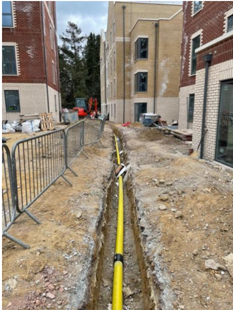
Gas connection works in progress