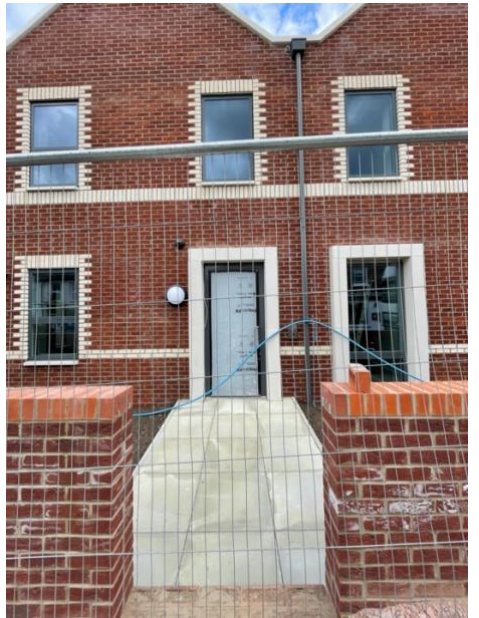
Front entrance to Parfitt almost ready bar the gate.