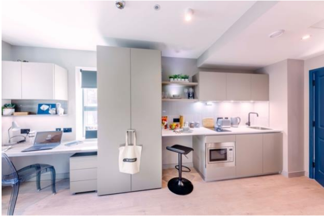
Images from the marketing suite