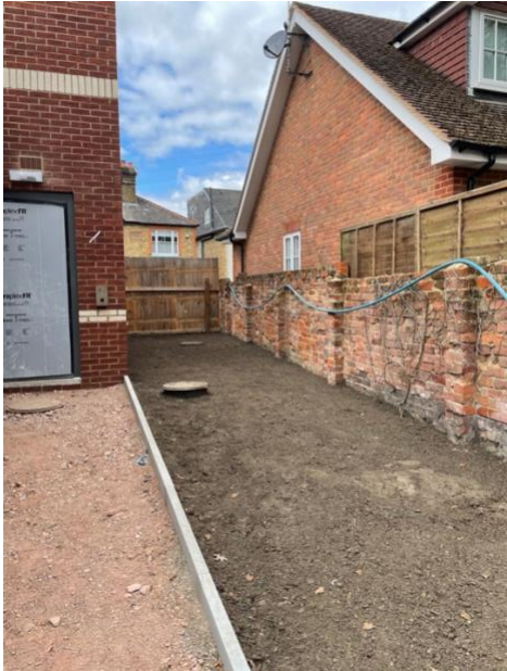
Topsoil installed outside of Parfitt ready for sowing