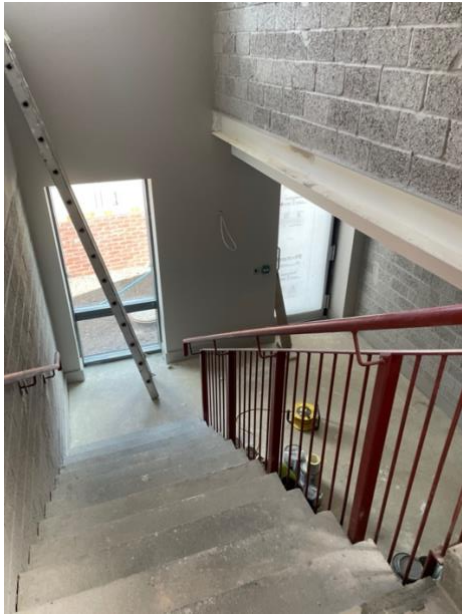
Stairs in Parfitt ready for flooring and balustrade finish