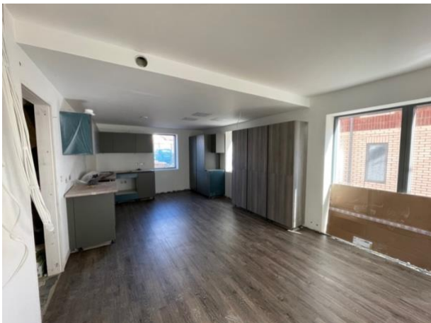
Flooring installed in Preedy cluster kitchen.