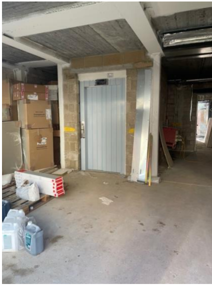
Lift installation complete in MacDonald Foyer