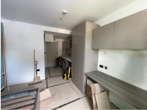
Furniture installation underway in Parfitt