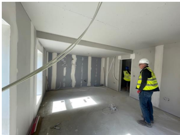
Current status cluster kitchen in last block - Townsend