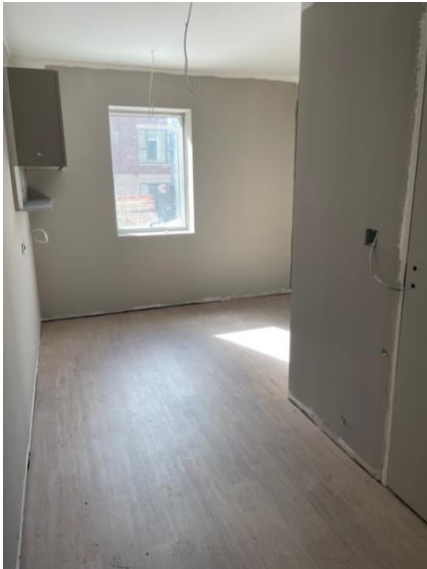
Floor installed to cluster bedroom in Preedy