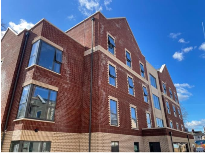
Last bit of scaffold to Townsend will be removed Saturday 20 March MacDonald