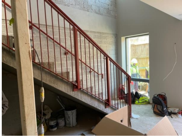
Balustrade installation underway in Parfitt