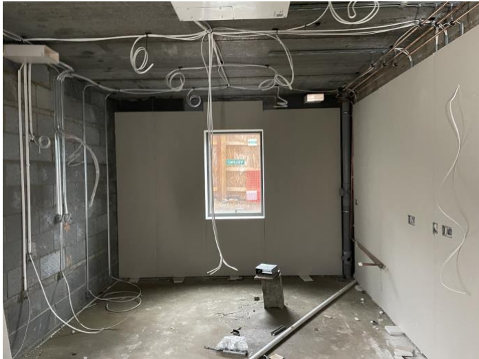
Dry lining in progress to cluster kitchen ground floor Preedy