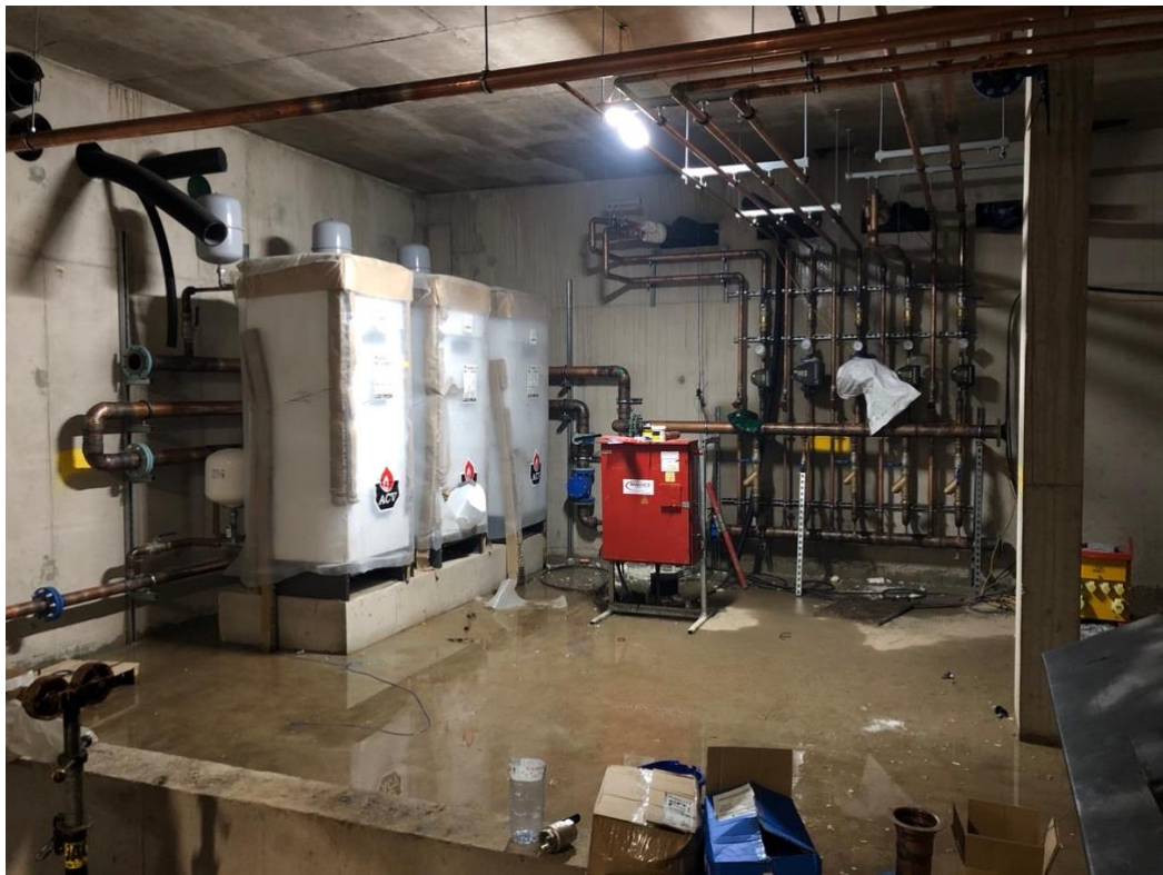
Plant room resembling a ship's machine room!