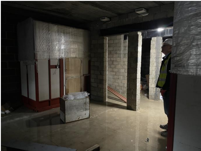
Townsend wet due to slow progress with flat roof installation