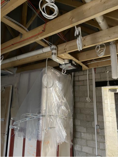
Mechanical ventilation installed to top floor studio