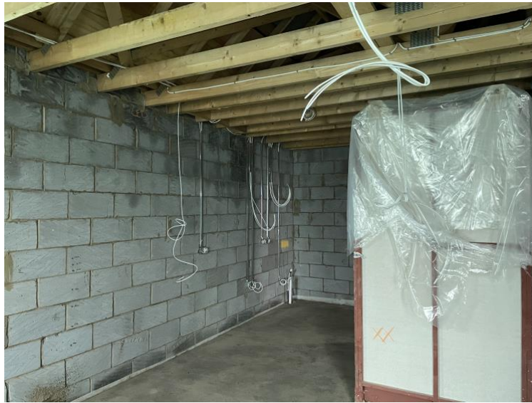
Electric 1st fix complete in Parfitt ready for plaster boarding for walls and ceiling