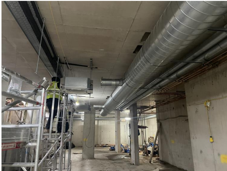
Installation of ventilation system to communal spaces in lower ground floor of Townsend