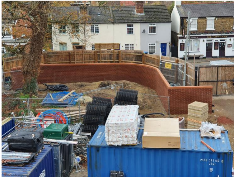
Boundary wall to Harvest Road completed