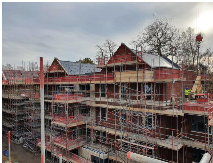
Low level pitched roof being installed to MacDonald