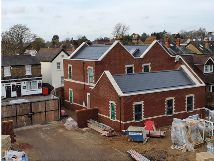
Parfitt finally without scaffolding