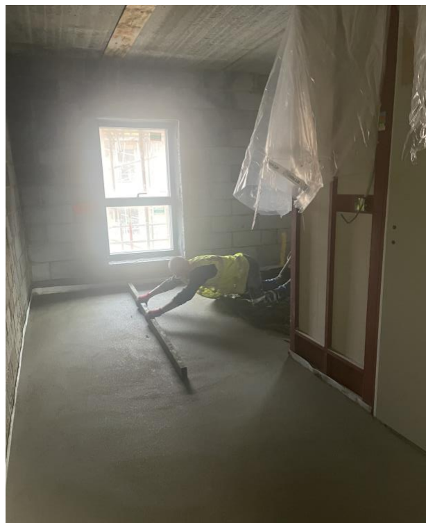
Screeding to cluster bedroom at 2nd floor MacDonald