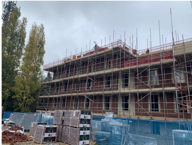
Carpentry to MacDonald almost complete