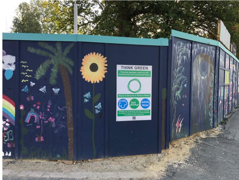
The hoarding will be updated to include new images of the development