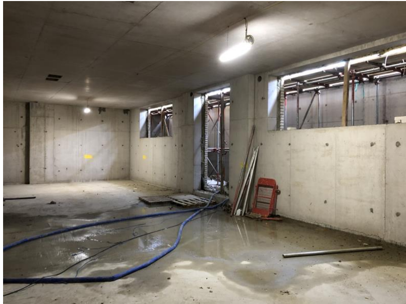
This will eventually become the common room in lower ground floor of Townsend