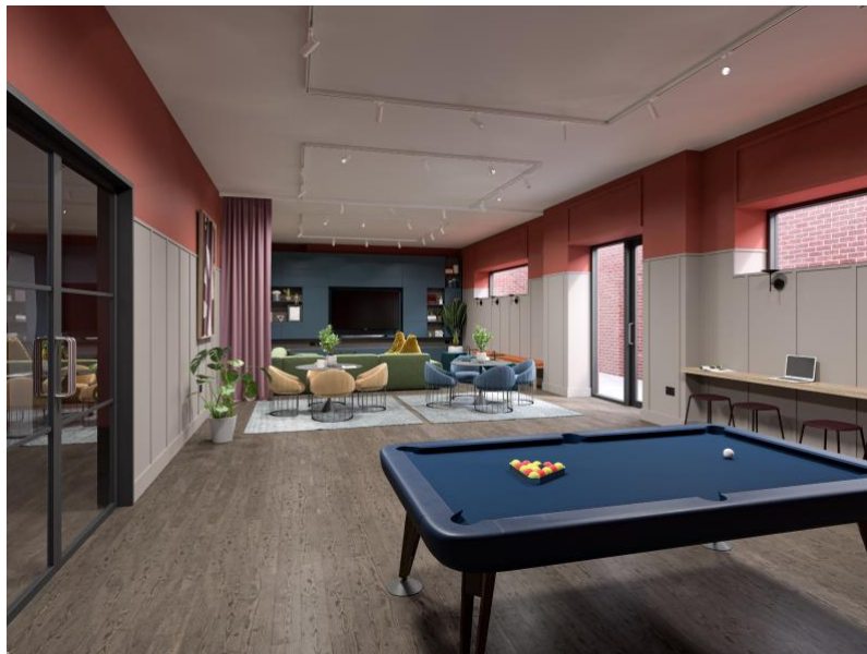
And it will end up looking something like this...and will be known as